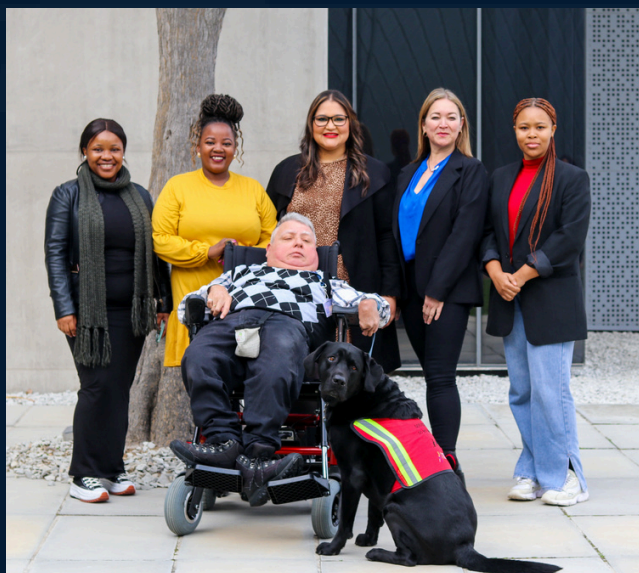
ENGAGEMENT OFFICE'S CAREER SERVICE UNIT TEAM