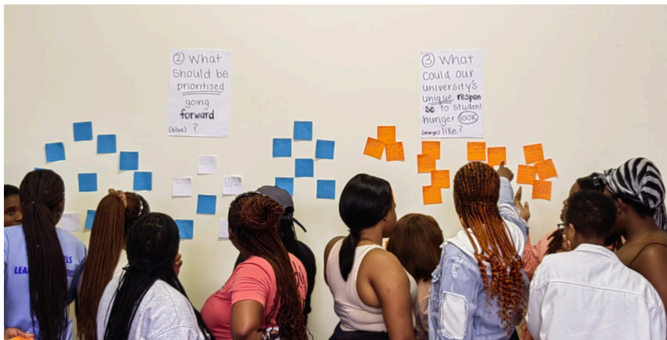
PARTICIPANTS AT HLUMA INDABA WORKSHOP