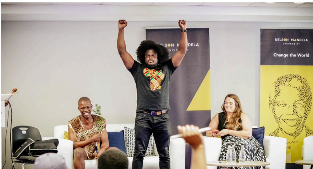
The Engagement Office Team in character for their Africanisation-Decolonisation Indaba input, a drama skit titled "Echoes of Change: Shaking the Table."

The drama skit aimed to disrupt traditional ways of dialoguing about the processes of institutional change, which are often met with resistance and contestation. The skit offered a compelling lens through which to examine, dissect, and provoke discourse on the complexities of engagement – especially, as Nelson Mandela University endeavours to be an African dynamic institution in service to society. Using satire and allegorical significance, the skit captivated and stimulated audiences to think about issues that have typically remain obscured.