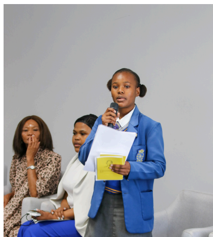
SCHOOL LEARNER FROM GELVENDALE HIGH SCHOOL